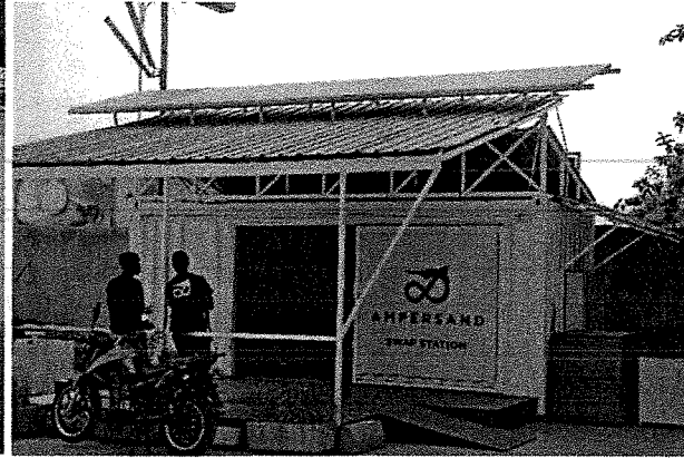
Pictures showing the progress on AMPESAND project which is aiming to introduce electric motos in Rwanda, this was taken during our field visit monitoring exercise at Gikondo charging station.